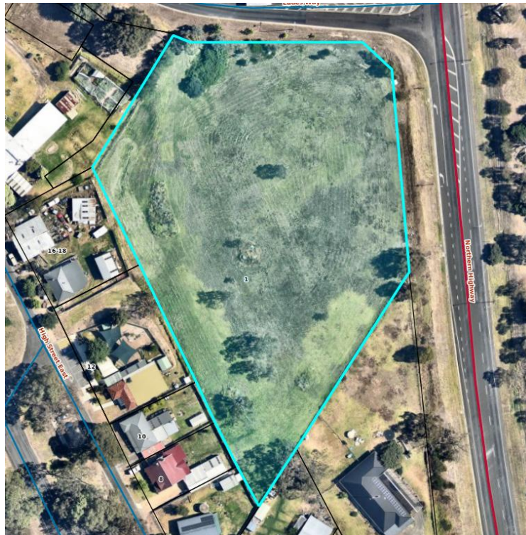
Figure 1 – Subject site

1.1 The subject site and surrounds are shown at Figures 1 and 2.