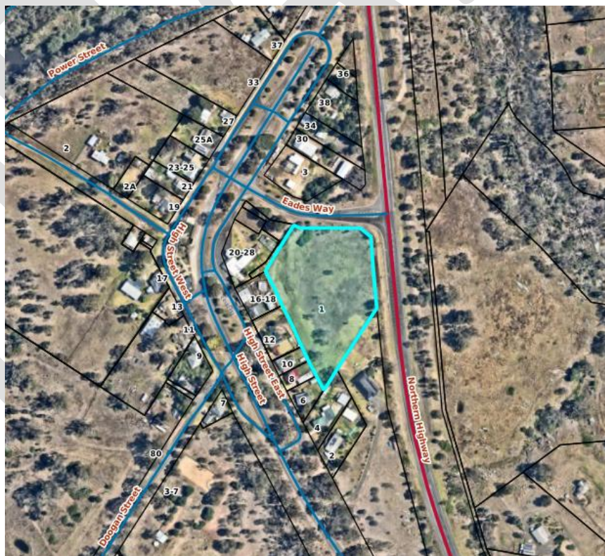
Figure 2 – Site and surrounding area