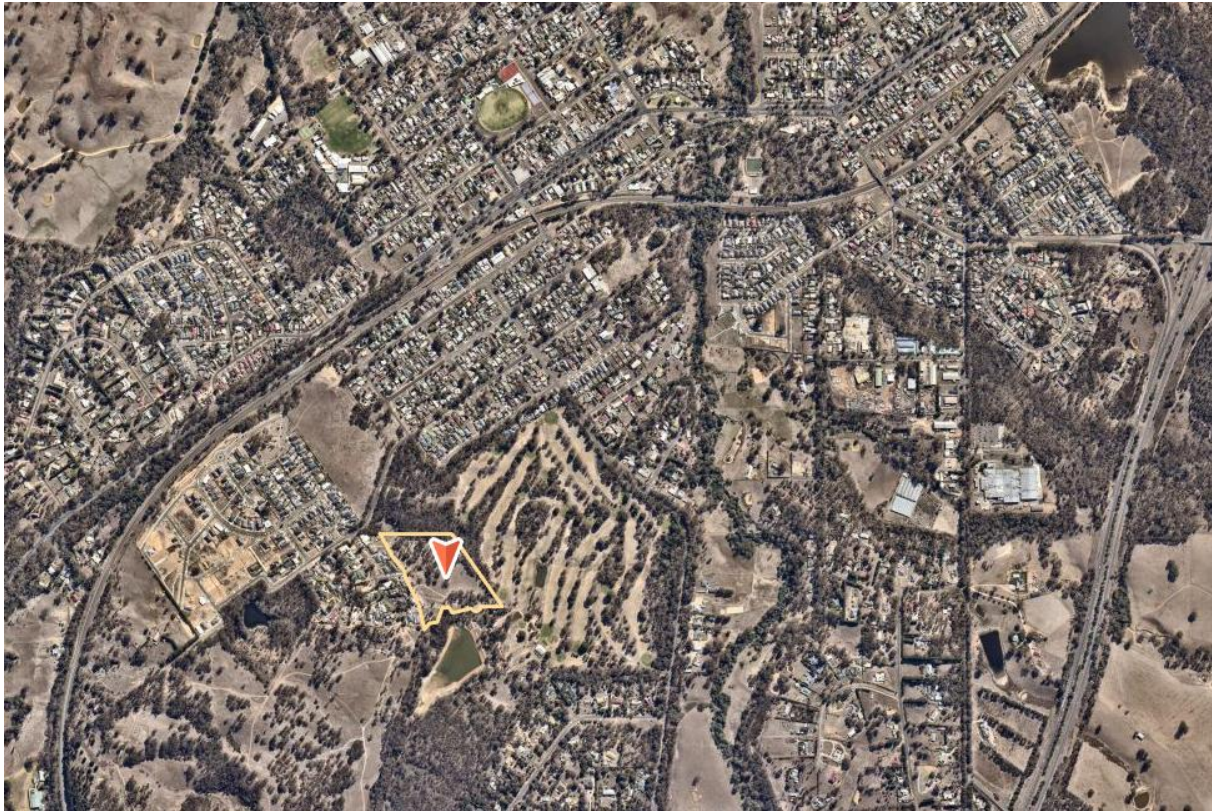
Figure 2 – Subject Site and Surrounds, Nearmaps April 2025

PLANNING PERMIT APPLICATION PLP294/21 FOR A STAGED MULTI-LOT SUBDIVISION, REMOVAL OF NATIVE VEGETATION AND REMOVAL OF EASEMENTS AT 85 RESERVOIR ROAD BROADFORD VIC 3658 (CONT.)